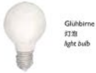
Glühbirne 灯泡 light bulb