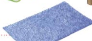
Bettdecke 被子 quilt