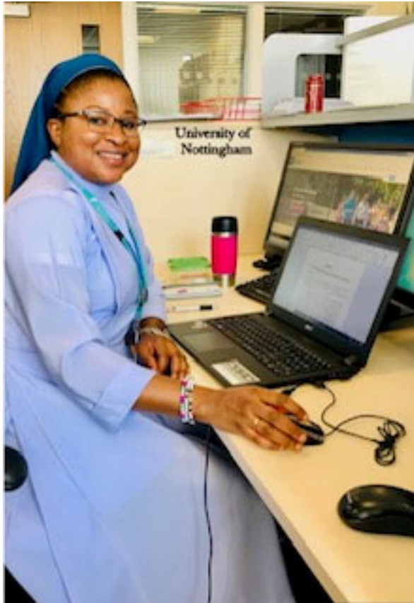
My Desk at the Research Office of the Queen's Campus

My mentors drew my Program before my Arrival which we adjusted together, I was greatly impressed by their friendliness and flexibility. I was assigned a desk at the Research office and granted access to the University Information Technology services. This availed me with academic friendly atmosphere for effective experience.