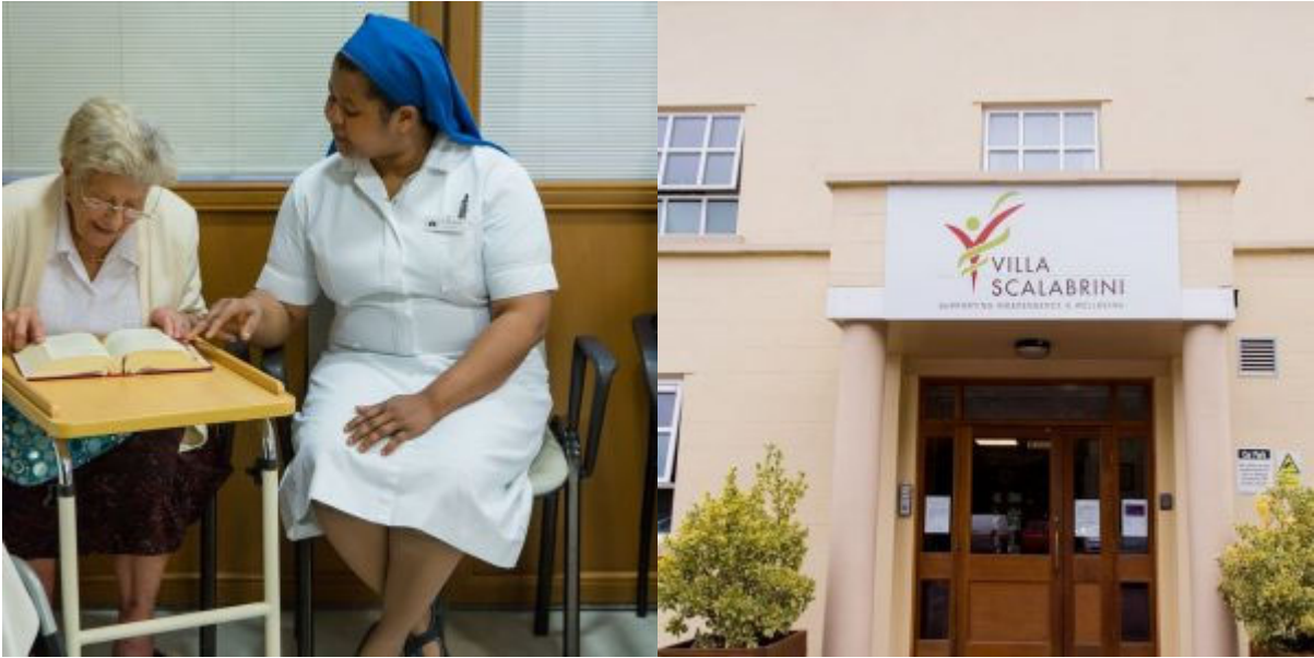
Daughters serving the Lord in His people.