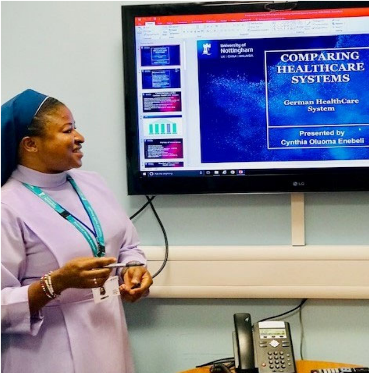
Practicing Pedagogy: An opportunity to practice my Skills as a future Pedagogist