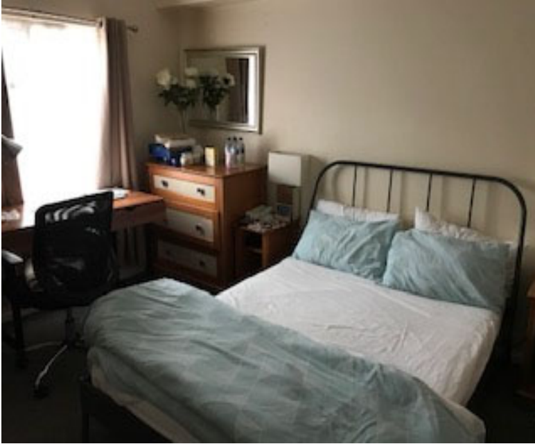
My Room with my comfortable Bed, really served it Purpose