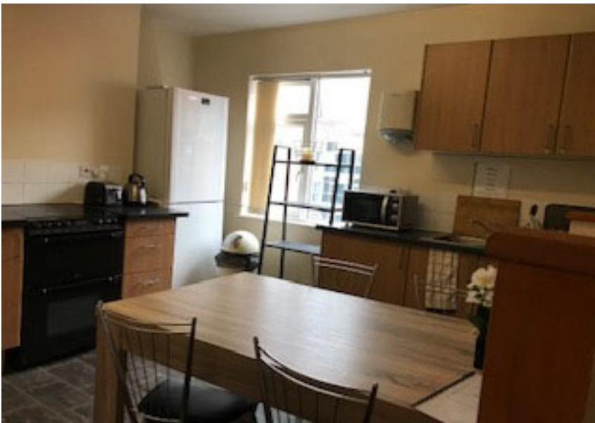
Man must shop!!! A kitchen that served me perfectly throughout my Stay