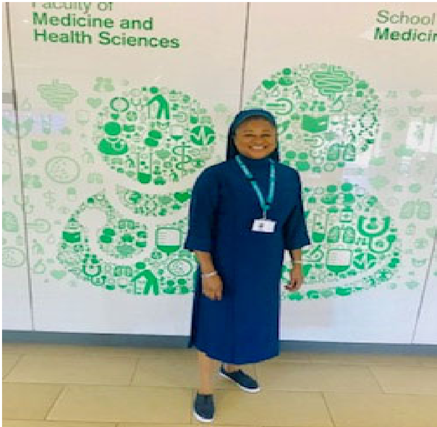
Faculty of Medicine and Health Sciences Though compressed in the Picture but still smiling!

The Staff and Students were very kind and friendly and ready to help and assist me in adapting to the system of the Faculty. I was also introduced to the three different divisions and academic programs of the School of Health Sciences namely the School of Nursing, the School of Midwifery and the School of Physiotherapy located in different Campuses, QMC Campus, University Park Campus, Jubilee Campus and City Hospital Campus.