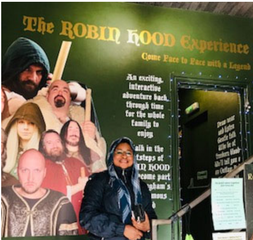
The famous Legend Robin Hood originated from Nottingham