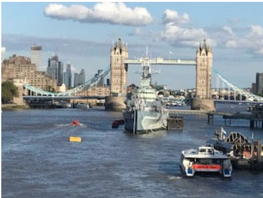
London Tower Bridge