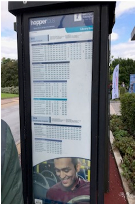
Hopperbus Busstop and Bus Plan