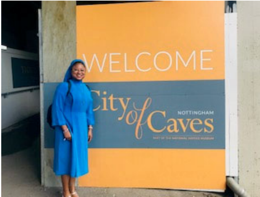
Historical Attraction in Nottingham

Nottingham is a beautiful international and intercultural city with many interesting and historical attractions like the Nottingham City Caves, Castle, the Arboretum, Wallaton Hall and Gardens, Museums and more interestingly the famous Legend Robin Hood who originated from Nottingham.