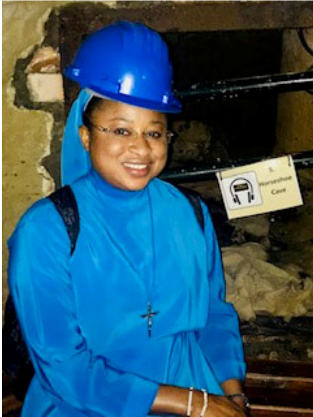
Still inside the Cave