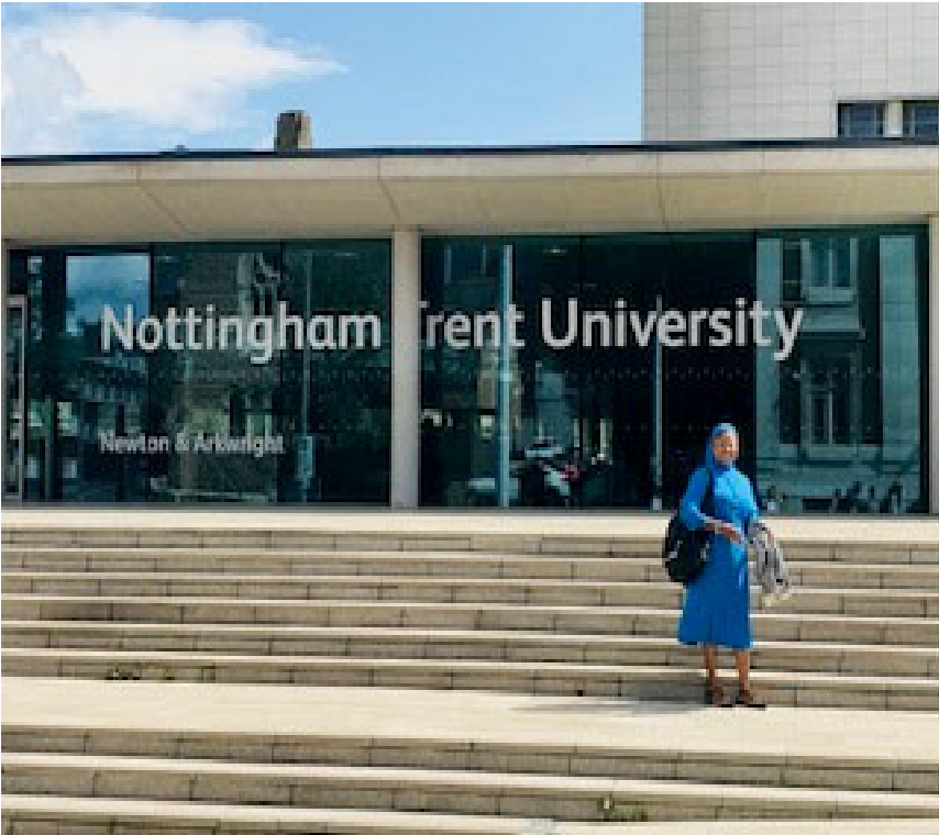
Another University in Nottingham, Nottingham Trent University