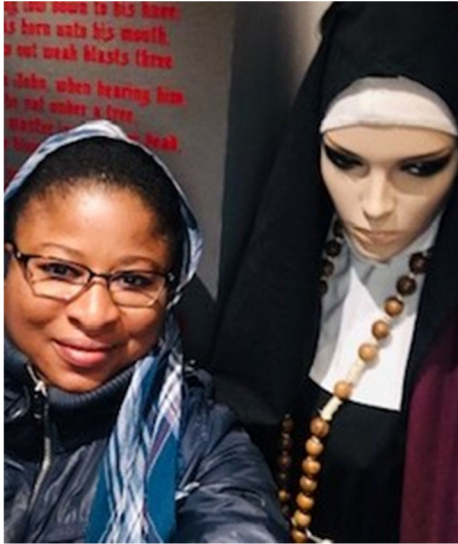
Radlett Community, Villa Scalabrini