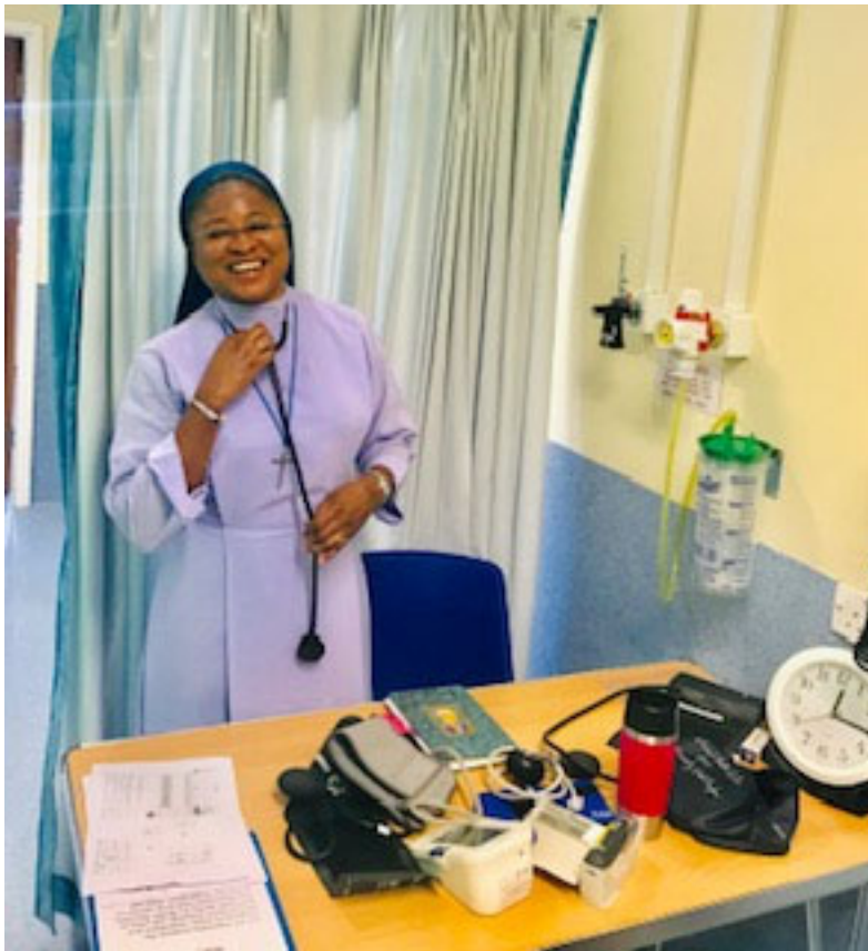
On Duty, Clinical Skills Laboratory of the University