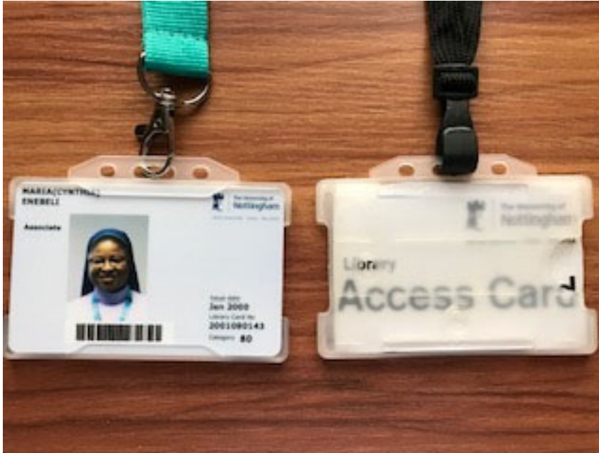
My University ID Card and Library Access Card