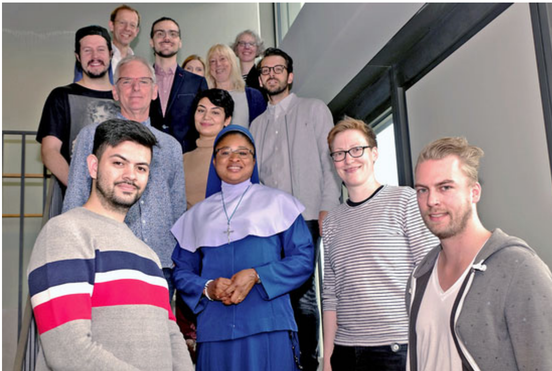
Commission for Study, Teaching and Quality Improvement (KStLQV)

“Man tut was man kann, frau auch“; Trying to bloom wherever i am planted and add my own quota!