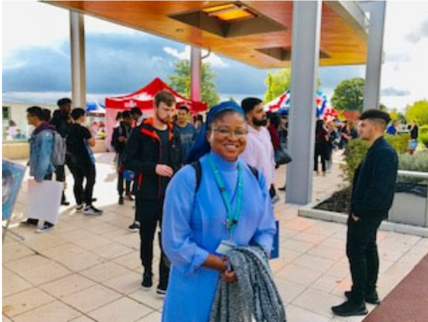
At Portland building Hopperbus Busstop at the University Park Campus. Smiling and just being happy and grateful!