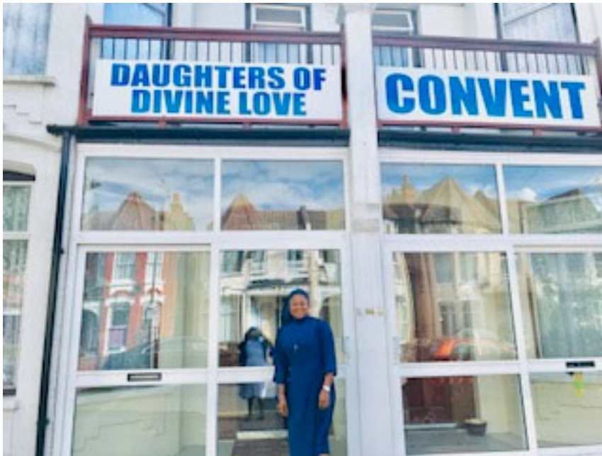
DDL Regional House Woodgreen, London

Also visited my Sisters in some Communities