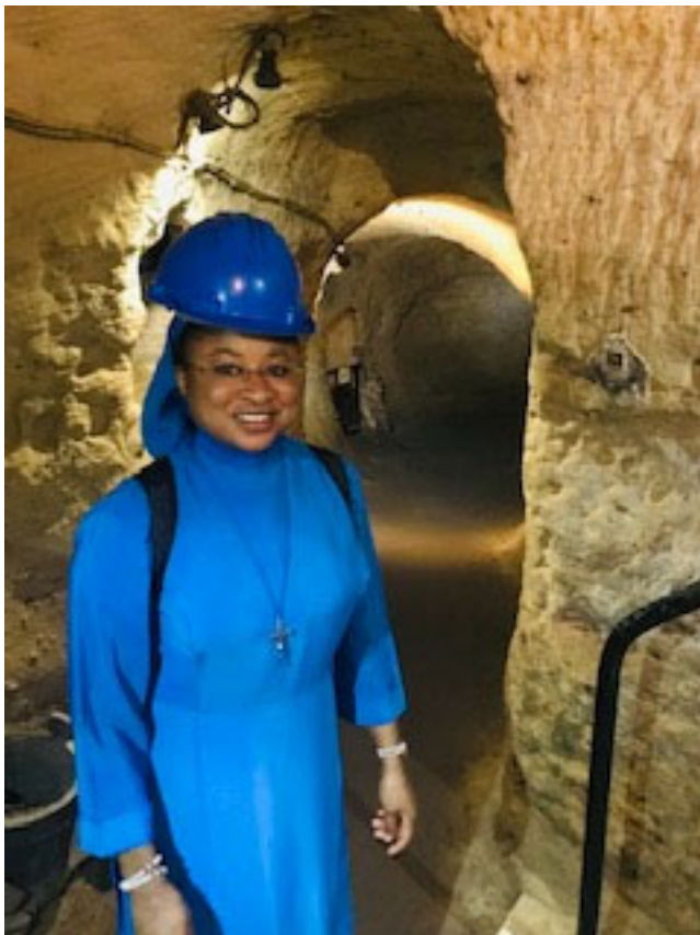
Exploring the City of Caves