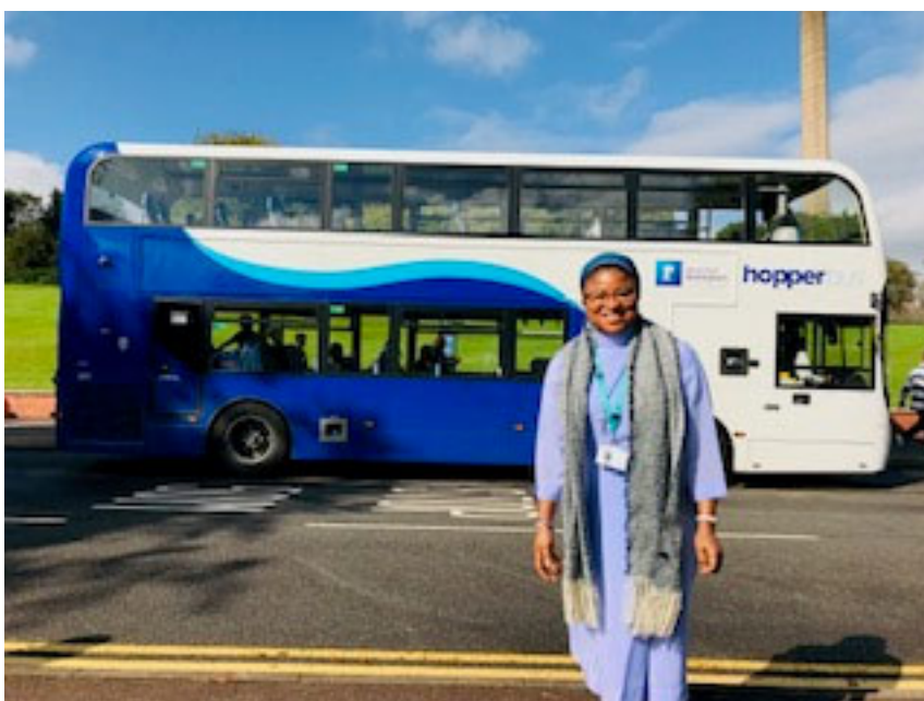
The University Hopperbus that takes us around from Campus to Campus I really enjoyed the Rides!

The Staff and Students were very kind and friendly and ready to help and assist me in adapting to the system of the Faculty. I was also introduced to the three different divisions and academic programs of the School of Health Sciences namely the School of Nursing, the School of Midwifery and the School of Physiotherapy located in different Campuses, QMC Campus, University Park Campus, Jubilee Campus and City Hospital Campus.