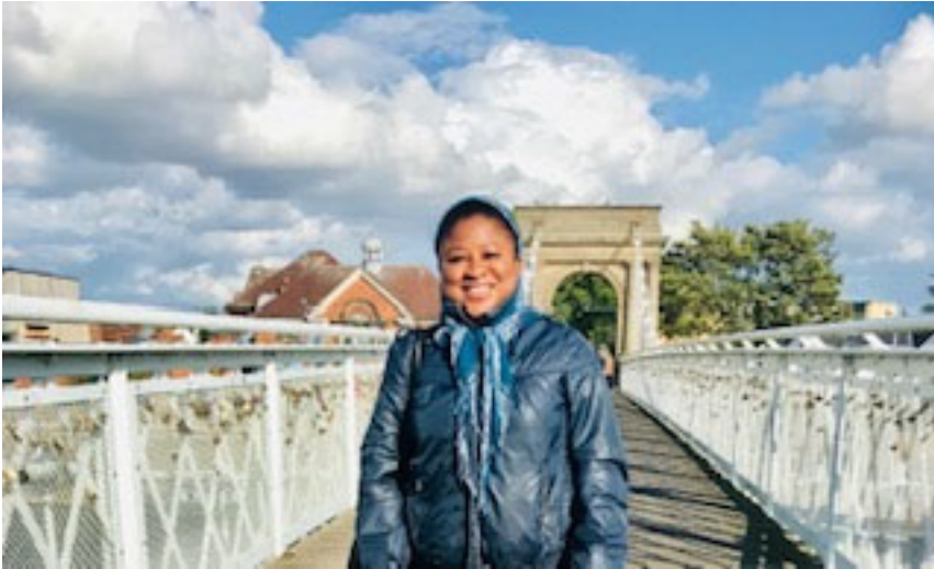
Trent bridge in Nottingham