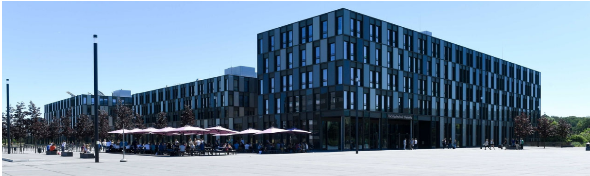
University of Applied Sciences Bielefeld